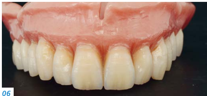
06 — The denture base was injection moulded and then reduced to create space for creating soft tissue customizations.

material with the injection moulding technique. The pre-dosed denture base material was mixed and filled into the injector together with the flask. The appropriate program was selected and the injection process started. The accuracy of fit on the plaster model was ideal on the first try; reworking was minimal.