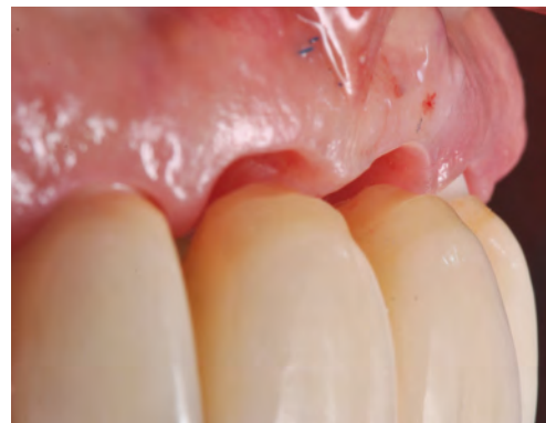
15 — Integration of the bridge in the periodontium