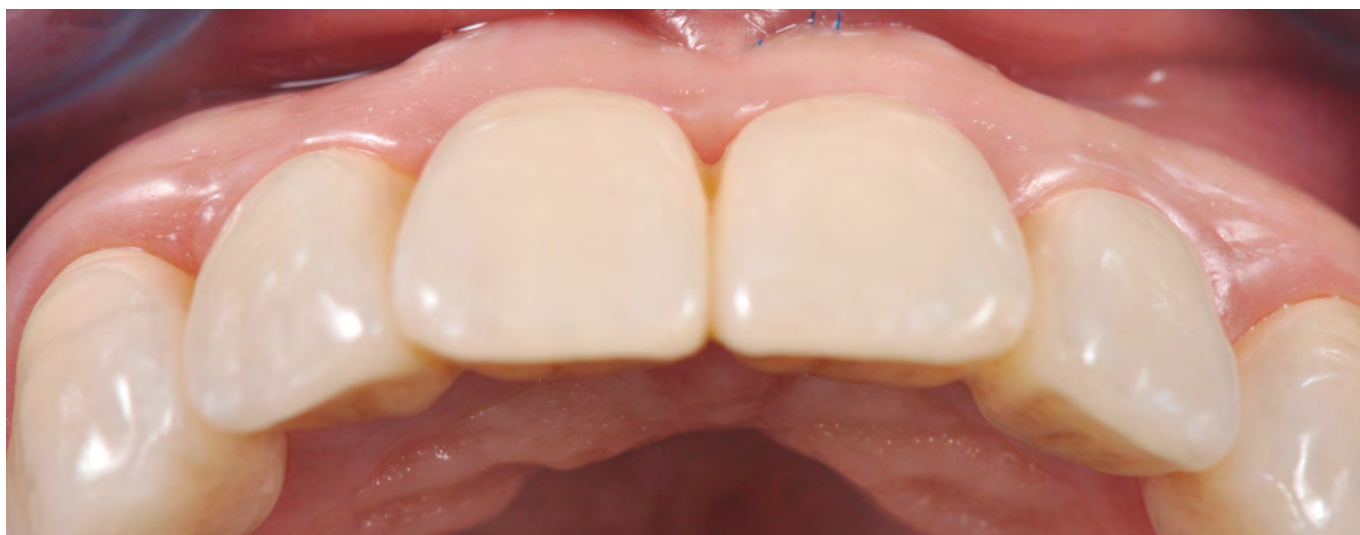
18 — Occlusal view. The convex shape of the gingiva has been restored.