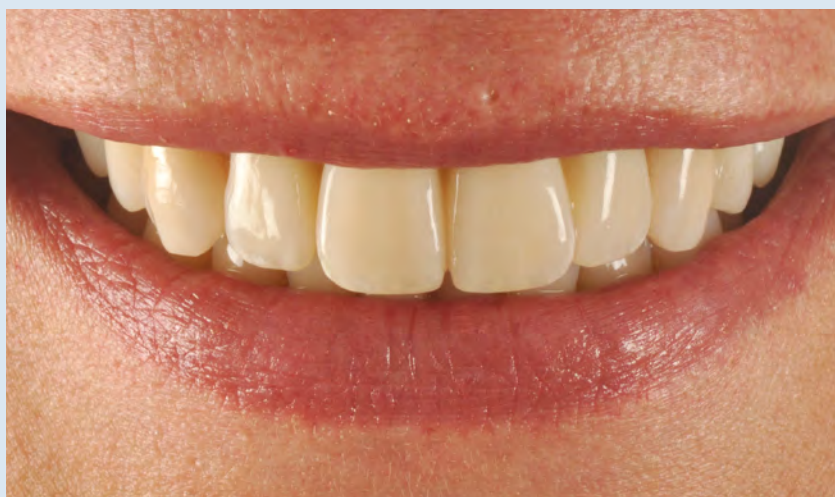
20 — Front view of the lip line with the patient smiling