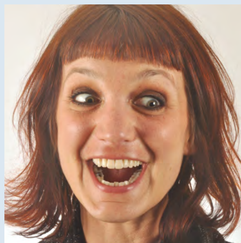
21 — A happy patient