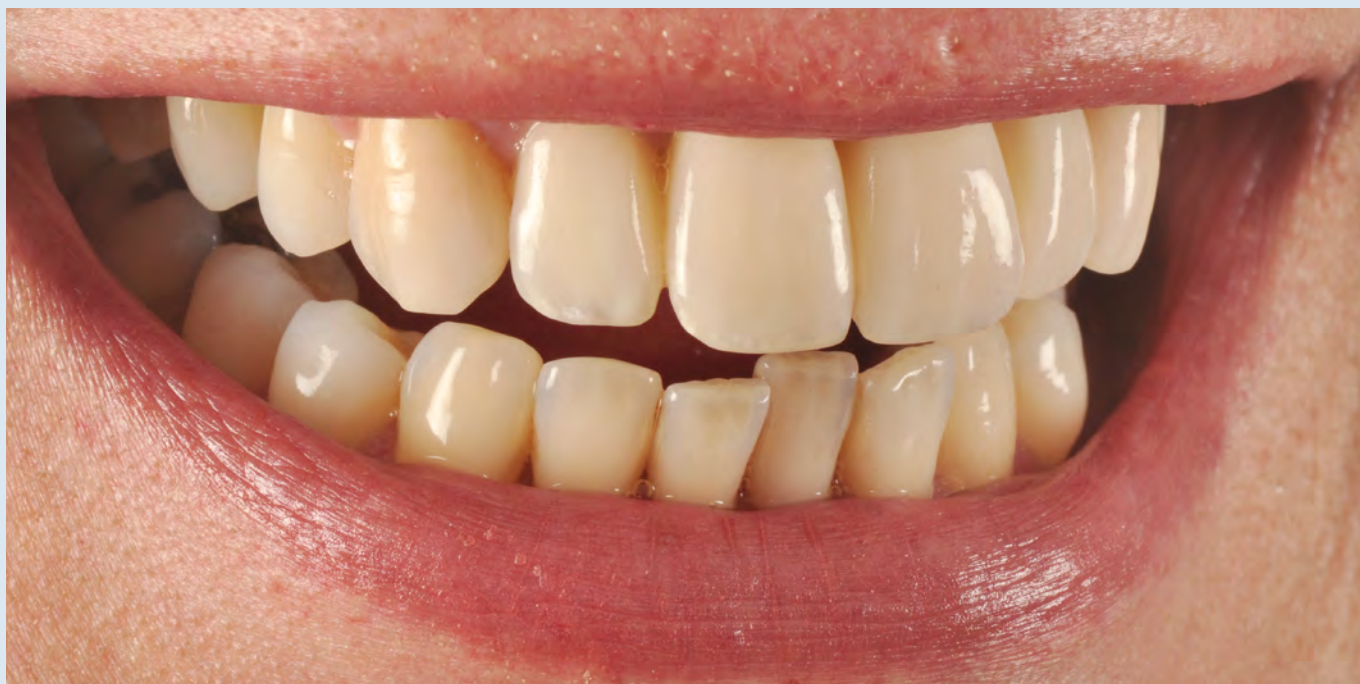
19 — Close-up of the smile. Ideal light-optical properties