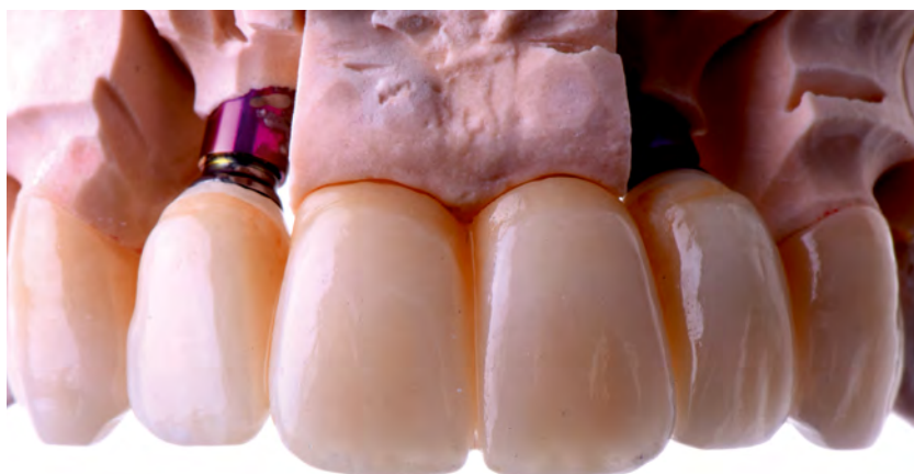
11 — Translucency of the zirconium oxide