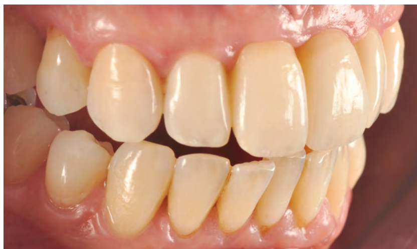
17 — Inspection of the functional parameters