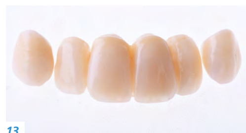
13 — The restorations before placement