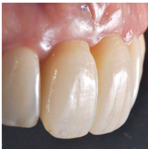
16 — Natural-looking emergence profile

Press lithium disilicate abutments were etched with hydrofluoric acid and then silanized with Monobond Plus in order to condition them for the bonding procedure to the bridge. The permanently seated zirconium oxide-supported crowns and the bridge exhibited a translucency level similar to that of lithium disilicate (Figs 16 to 18). The result in this case was exceptionally esthetic: The relationship between the restorations and the soft tissue looks harmonious and natural (Figs 19 to 21).