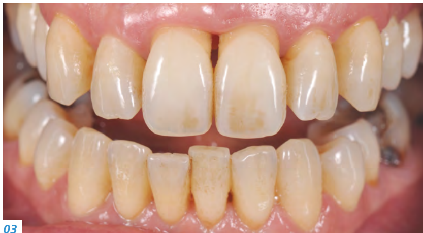
03 — Intraoral view. Severe periodontitis had caused gingival recession on the two central incisors in the upper jaw.